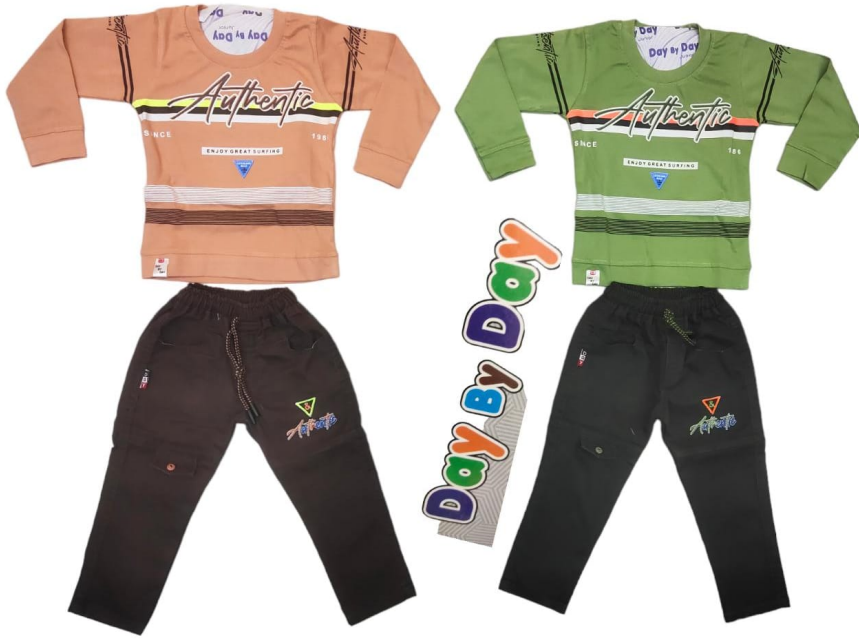
R28005-16/20-F/D-Day By DAY